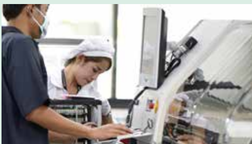
GPV has medtech specialists in Asia, Europe, and the Americas